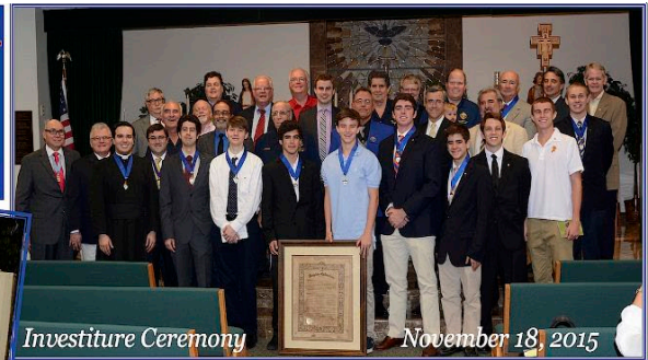
Investiture Ceremony November 18, 2015