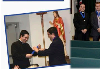
Councils 3080 and 4955 welcomed Squires at Cardinal Gibbons High in 2015.

works he and others were doing each visit was nothing short of inspirational, on top of hearing and seeing from earliest childhood many other examples of 4955's greatness. Between that and the overwhelming welcome and hospitality I received each time, I became motivated to get involved as